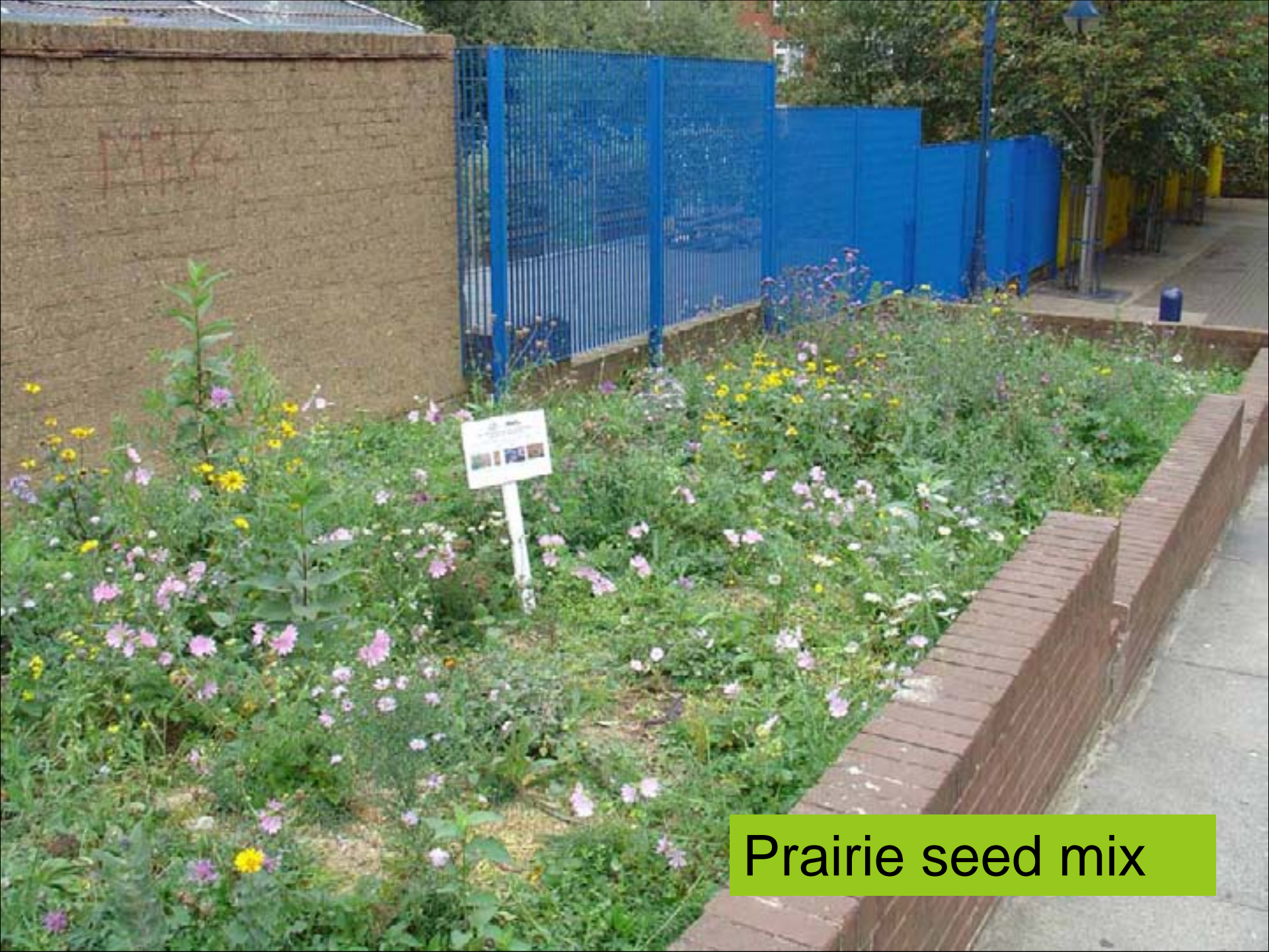
Prairie seed mix