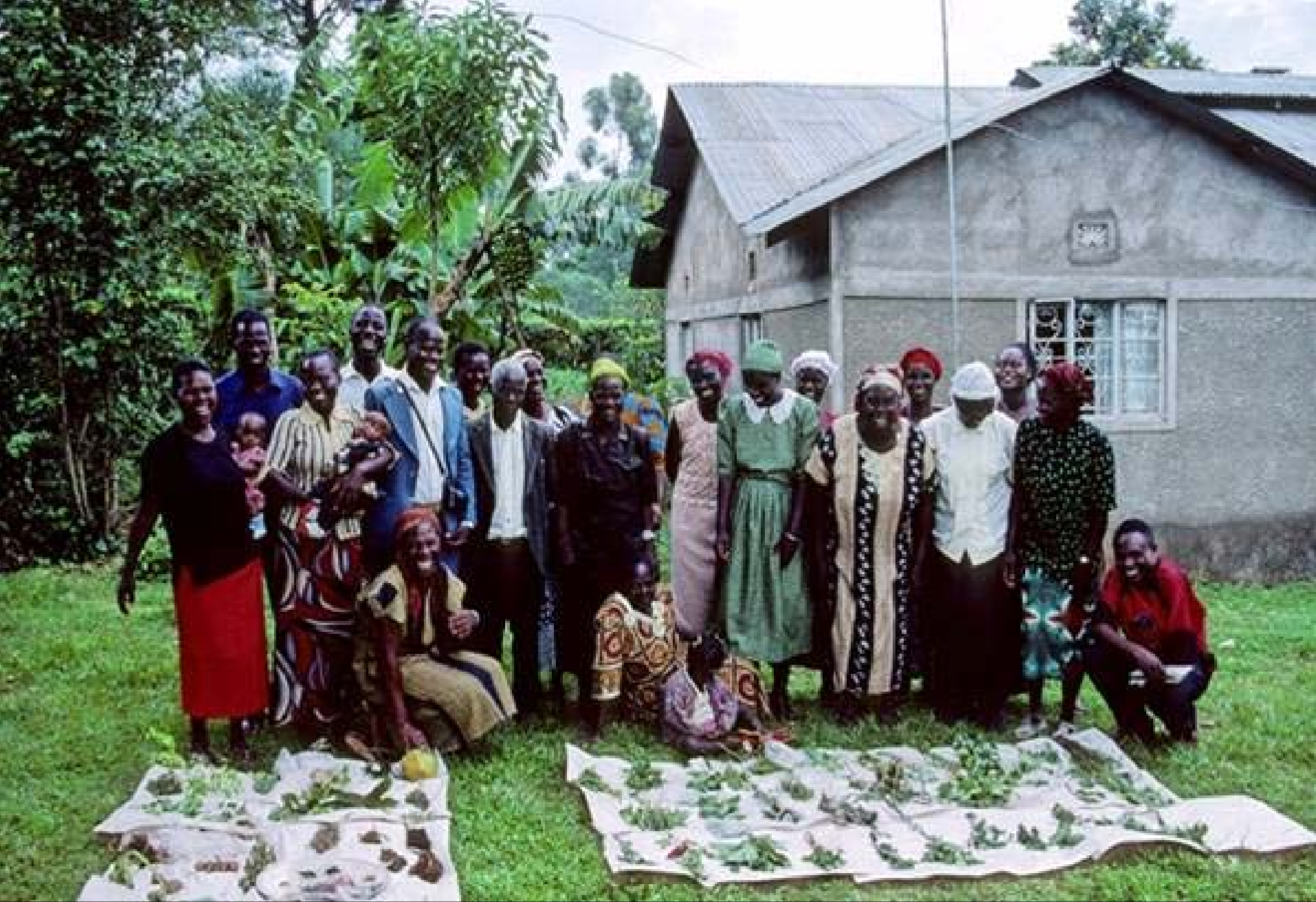
Members of BIDII Women's Group with some of their traditional food plants