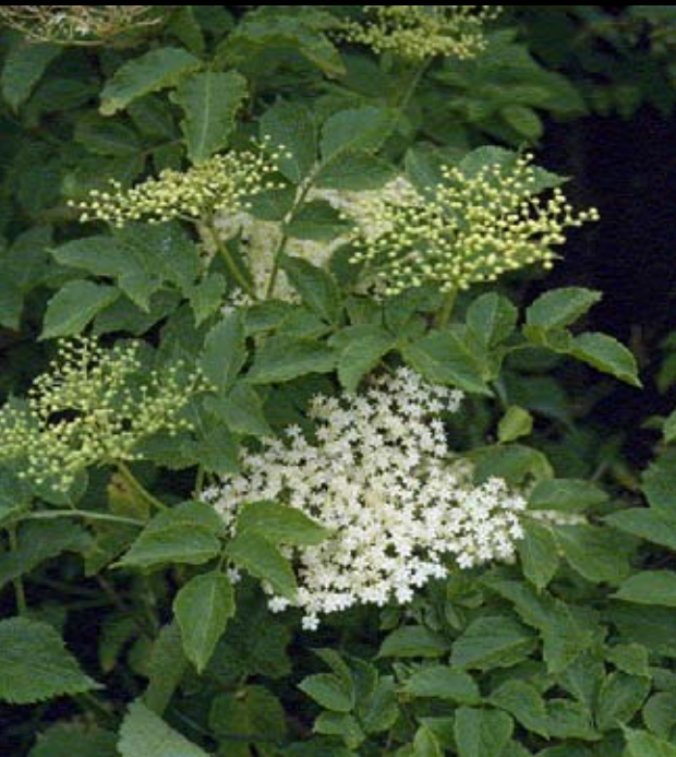
Trade in UK species