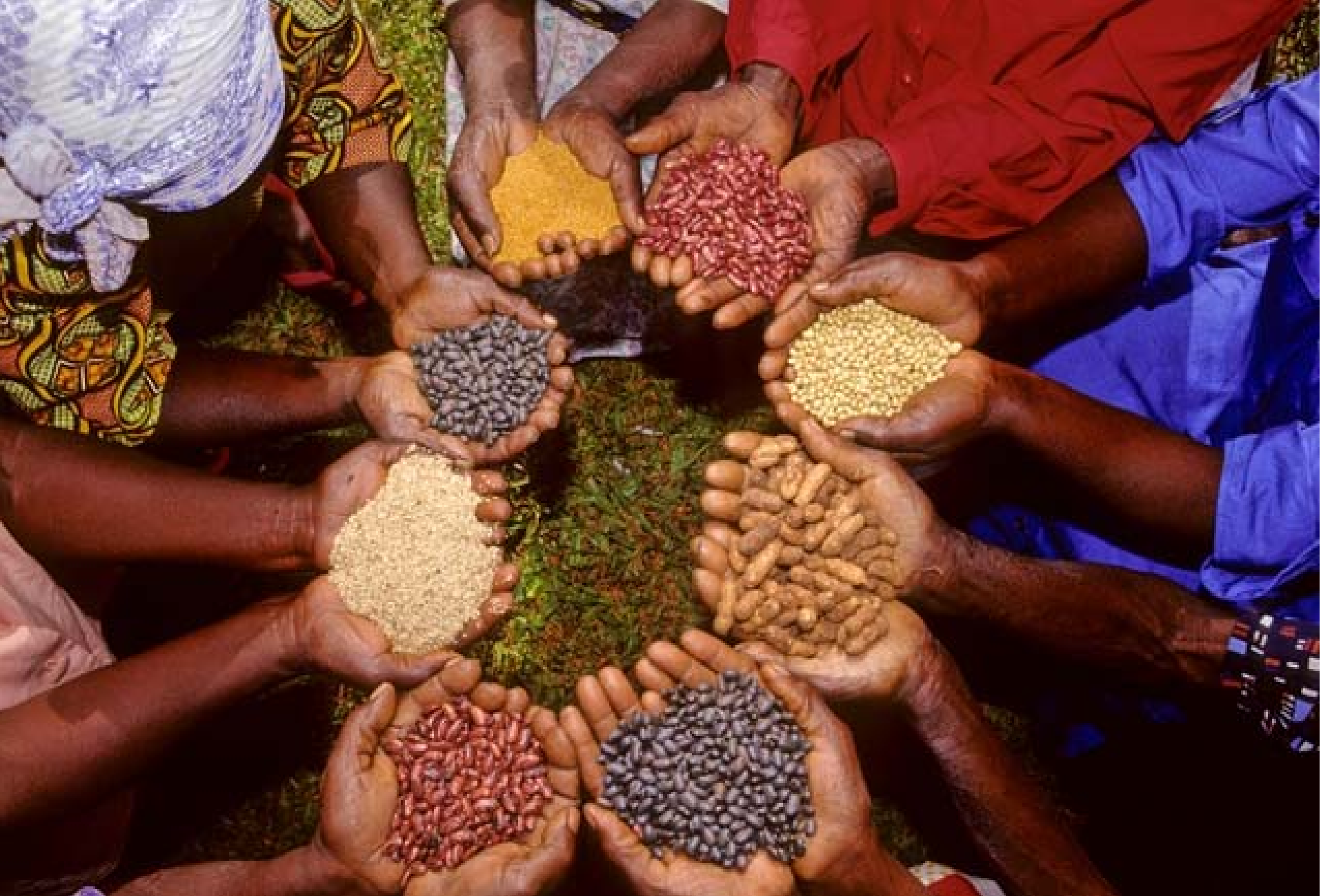
Some of the biodiversity for food maintained by TATRO Women's Group in Western Kenya